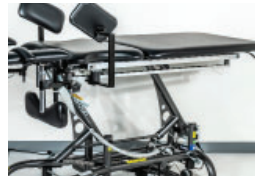
Thigh support brackets travel 43" a long the side of the table