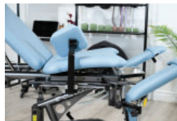
Thigh support brackets travel 13" a long the side of the table