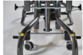
Optional rear leg soft touch footswitch configuration